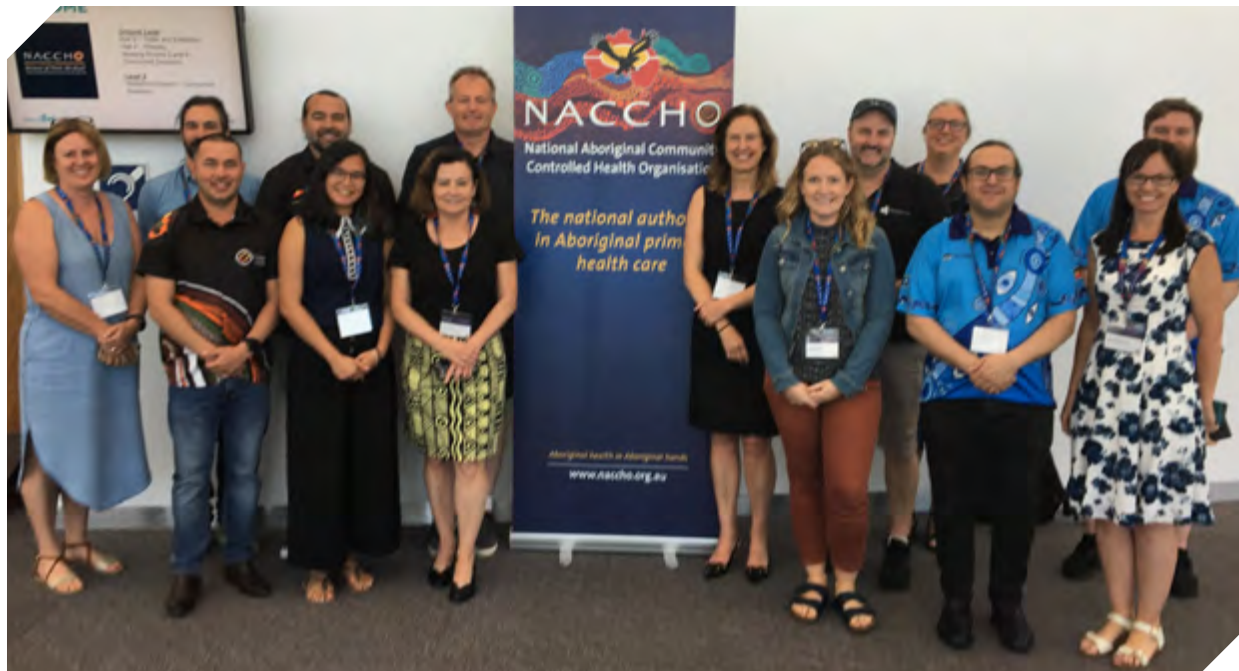
Vision 2020 members and staff at a national meeting.