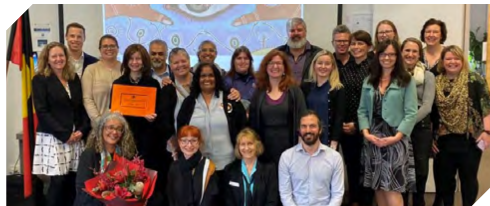
World Sight Day 2019 launch of Looking Deadly.