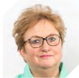
The Hon Amanda Vanstone AO Chair