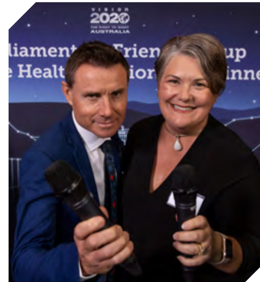
Andrew Laming MP and Meryl Swanson MP, PFG Co-Chairs.

Meetings and a survey of members over the March-June period highlighted just how adaptable the sector is and the contribution it makes not just to vision, but to social connection, inclusion and broader containment efforts.