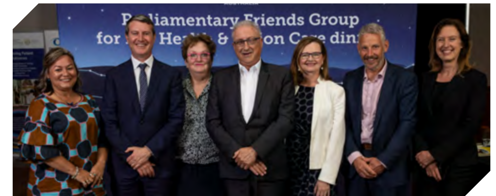
Board members at the Parliamentary Friends Group event.