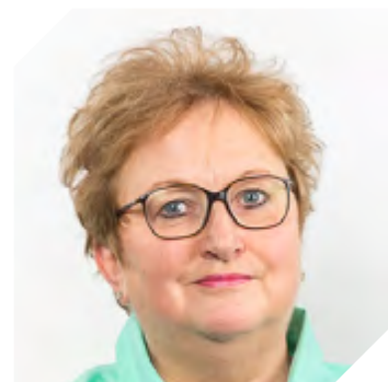
The Hon Amanda Vanstone AO Chair

While 2020 has not been the year any of us were planning for, the organisation has continued to strengthen its advocacy on behalf of members, both prior to and during the COVID-19 pandemic.