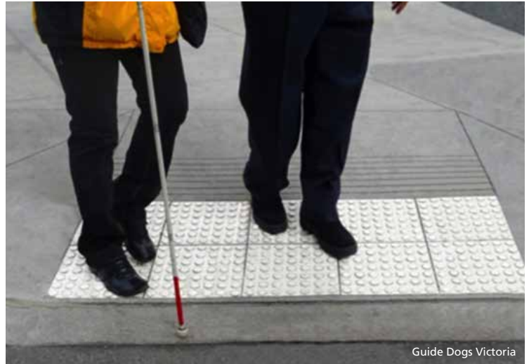
Guide Dogs Victoria