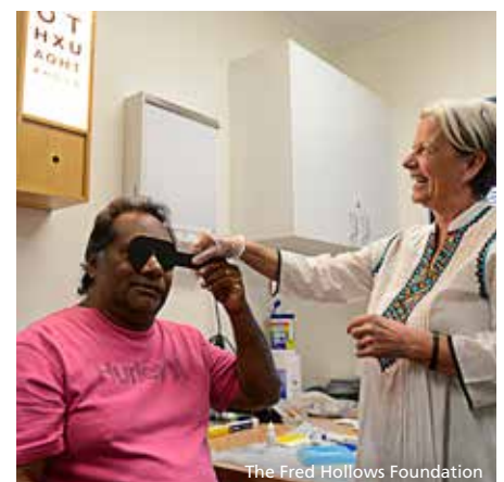
The Fred Hollows Foundation