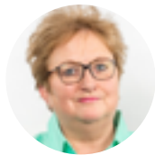
The Hon Amanda Vanstone