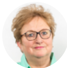
The Hon Amanda Vanstone Chair

Looking ahead, we are focussed on strengthening our member engagement, working with members to chart our future course, and continuing to enhance the way we work with and support collective effort and a unified sector voice.