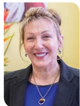
Amanda Vanstone Chair