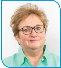
The Hon Amanda Vanstone (Chair)